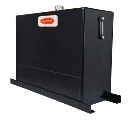
Notes: 1.15, 25, and 40 gallon tanks have two 2" NPT ports and two 1-1/4" NPT ports. 2. 35 gallon tank, supply port is 2" NPT and the return port is 1-1/4" NPT. 3. 7 and 10 gallon tanks have two 1" NPT ports and two 1-1/4" NPT ports.