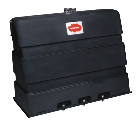
Notes: 1. Standard port size is 2" NPT. 2. Weight includes mounting kit.